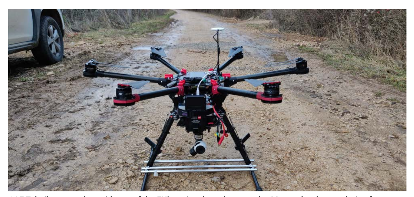
SAF Tehnika teamed up with one of the EU's national regulatory authorities to develop a solution for precise E-band link measurement and reporting using Spectrum Compact attached to a drone.